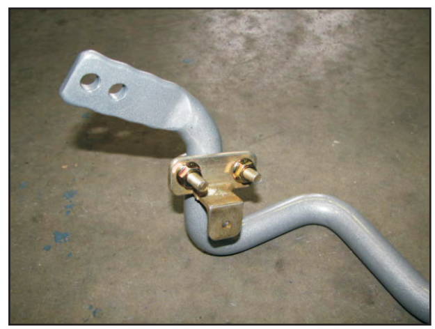
<u>Photo 2.</u> Whiteline Swaybar ride height sensor mounting bracket

Warning: Please drive carefully while you accustom yourself to the changed vehicle behaviour.