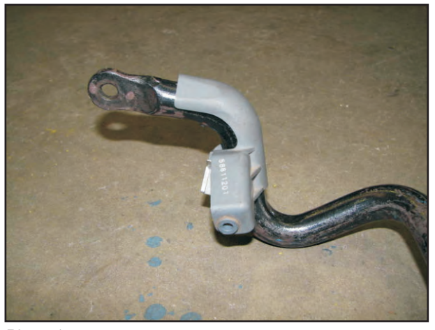
<u>Photo 1.</u> OEM Swaybar ride height sensor mounting bracket