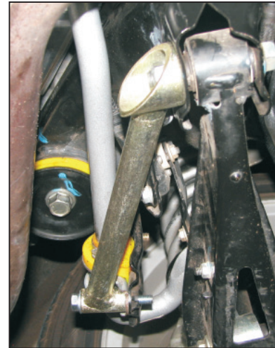
Fig 1 - LEFT brace