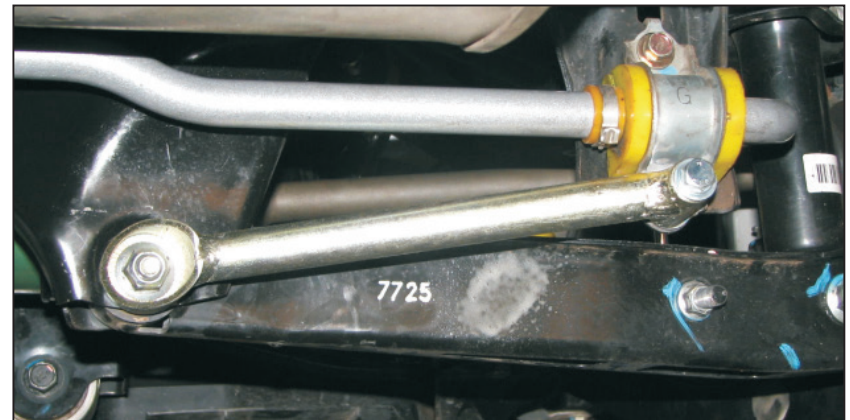
Fig 3 - RIGHT brace, rear view.

Warning: Please drive carefully while you accustom yourself to the changed vehicle behaviour .