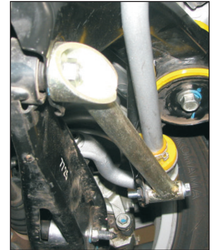
Fig 2 - RIGHT brace